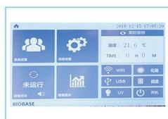
LCD touch screen

E-mail: export@biobase.com www.biobase.cc / www.biobase.com